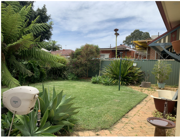
VIEW 3 EXISTING REAR PRIVATE OPEN SPACE & CLOTHES LINE