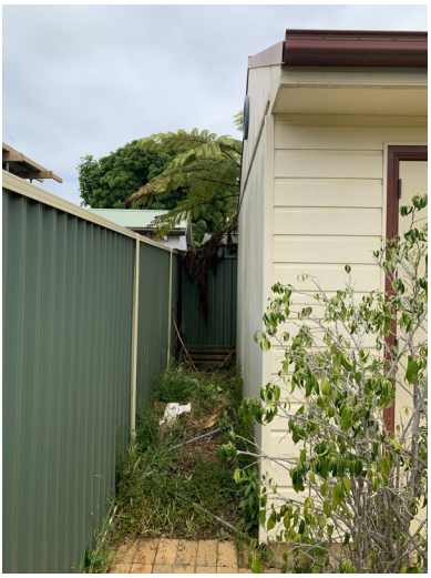
VIEW 4 EXISTING REAR GARAGE SETBACK