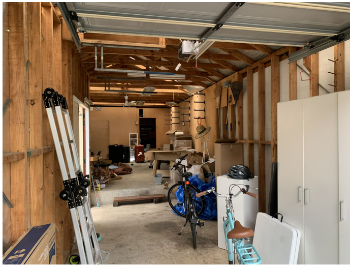
VIEW 6 EXISTING GARAGE INTERIOR TIMBER FRAMING AND STEPPED CONCRETE FLOOR LOOKING TOWARDS THE REAR