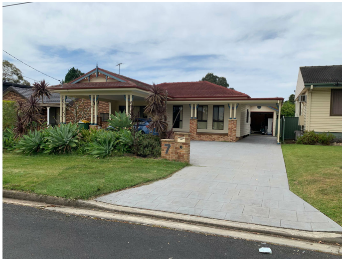
VIEW 1 EXISTING DWELLING AND GARAGE VIEW FROM STREET