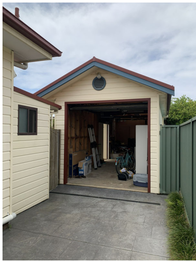
VIEW 5 EXISTING GARAGE ENTRY DOOR, STORMWATER DRAINAGE, CLADDING AND FINISH COLOURS